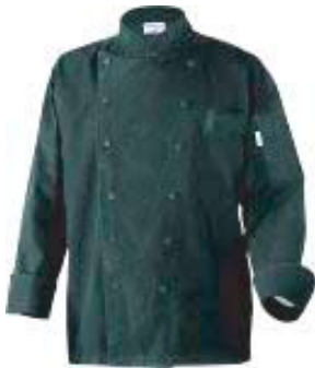
CC-27/BKL LYON EXECUTIVE COAT 35% COTTON, 65% POLY