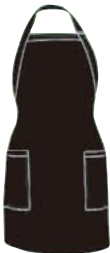
AP-7 30"LX24"W 2/PATCH POCKET APRON