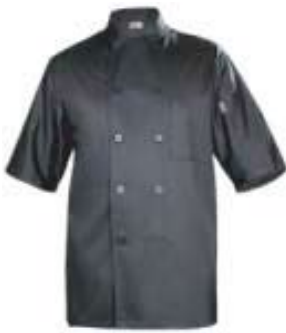
CC-3/S BASIC COAT 35% COTTON, 65% POLY

ALL UNIFORMS ARE AVAILABLE IN SHORT, MEDIUM & LONG SLEEVE SIZE FROM S-XXXL, LOGOS CAN BE EMBROIDERED