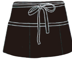
AP-1 12"LX23"W 35% COTTON, 65% POLY WAIST APRON