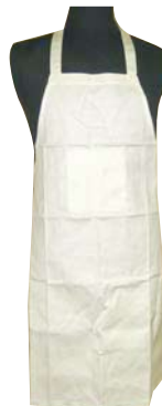
AP-8/WT 33"LX30"W BIB APRON