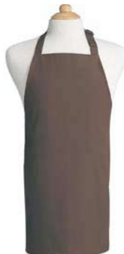
AP-8/BK 33"LX30"W BIB APRON