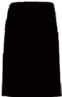
AP-3 32"LX30"W BISTRO APRON, W/O POCKET