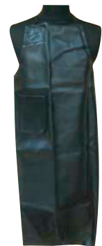
AP-9 41"LX26"W 100% PVC APRON