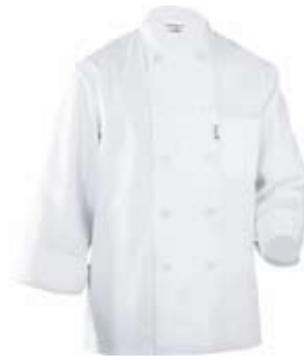
CC-2/L BASIC COAT 35% COTTON, 65% POLY