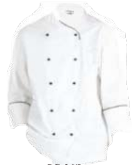
CC-26/L EXECUTIVE COAT 35% COTTON, 65% POLY