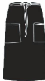
AP-5 32"LX30"W BISTRO APRON W/2 PATCH POCKET