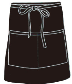
AP-2 19"LX30"W, 35% COTTON, 65% POLY, HALF BISTRO W/2 POCKETS