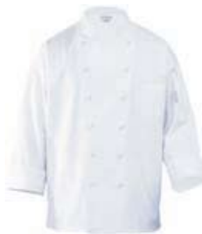
CC-27/WTL LYON EXECUTIVE COAT 35% COTTON, 65% POLY