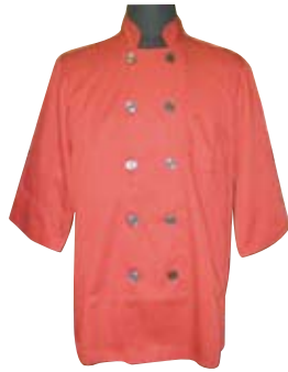
CC-5/M BASIC COAT 35% COTTON, 65% POLY