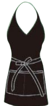
AP-6 32"LX30"W V-NECK TUXEDO APRON