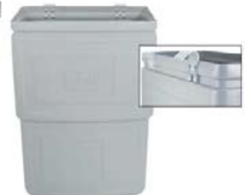
REFUSE BOXES 15 1/2"X22"X8 1/4"