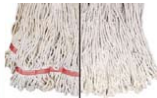
MOP HEADS 480, 680 GRAMS