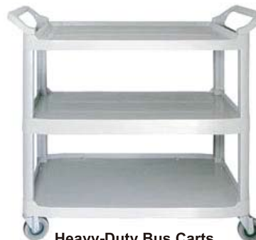
Heavy-Duty Bus Carts 31" x 16" x 37" (KD)