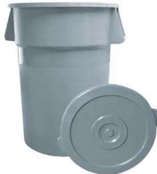
TRASH CANS-PLASTIC 32 GALLON, GREY