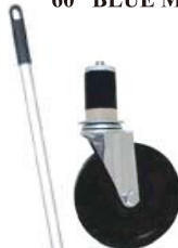
WORK TABLE CASTERS LOCK, N/LOCK 5"