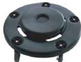
TRASH CAN DOLLIES 5 CASTER, BLACK PLASTIC 18"X6"