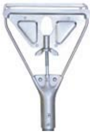
METAL MOP HANDLES 60" BLUE METAL HANDLE