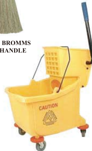
MOP BUCKETS W/WRINGER 36 QT. BUCKED W/WRINGER