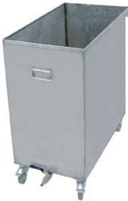
HOOD FILTER SOAK CARTS