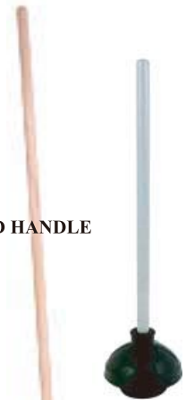
60" WOOD HANDLE