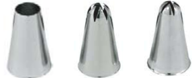
PLAIN OPEN STAR CLOSE STAR CAKE DECORATION TUVES