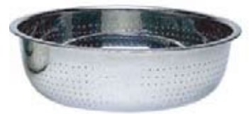
S/S COLANDERS 11", 15"D, 2mm, 4.5 mm HOLES