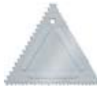
TRIANGULAR CAKE COMB