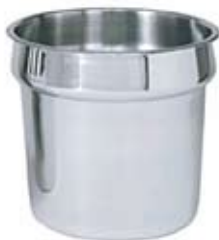
INSET 2 1/2, 4, 7, 11 Qt.