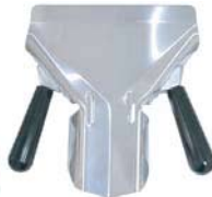
FRENCH FRY BAGGERS