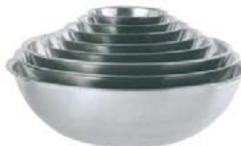
MIXING BOWLS 3/4, 1 1/2, 3, 4, 5, 8, 13, 16, 20, 30 Qt.