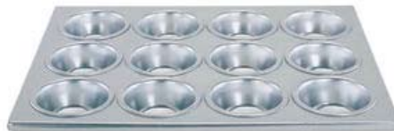
MUFFIN/CUP CAKE PANS 12Qt, 14"X10 3/4"X1" 24 Qt., 20 1/2"X14"X1"