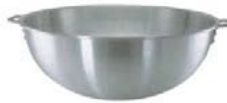
MIXING POTS 45 Qt.