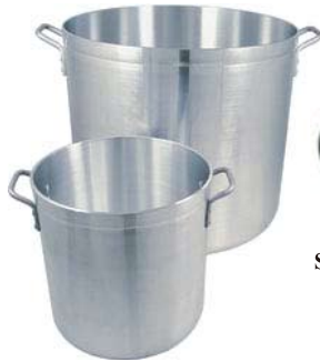
ALUM. STOCK POTS 12, 24, 40, 60, 80, 100, 120, 140, 160 Qt.