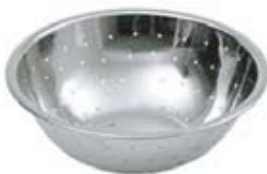
MIXING BOWLS 3/4, 1 1/2, 2 Qt.