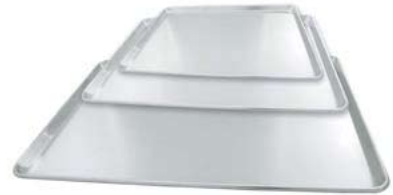
BUN PANS 9 1/2"X13", FOURTH SIZE 13"X18, HALF SIZE 18"X26", FULL SIZE