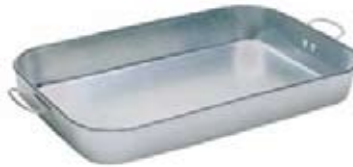
BAKE PANS 11 1/2"X17 3/4"X2 1/4"