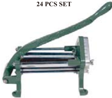
FRENCH FRY CUTTERS & BLADES CUTTER, 1/4", 3/8", 1/2", BLADE 1/4", 3/8", 1/2"