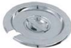
INSET COVER 2 1/2, 4, 7, 11 Qt.