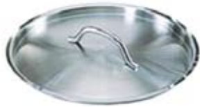
S/S PASTA COOKERS COVER 8, 12, 16, 20 Qt.