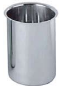
BAIN MARIE 1 1/4, 2, 3 1/2, 4 1/4, 6, 8 1/4, Qt.