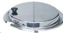
HINGED COVER 4, 7, 11 Qt.