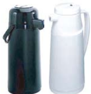
VACUUM INSULATED SERVERS GLASS LINED CLICK POUR SERVERS 33 OZ