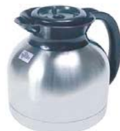
S/S BRU-THRU LID. 1.9 Lt.