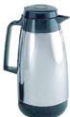
BRUSHED COPPER FINISH,1.6, 1.9 Lt.