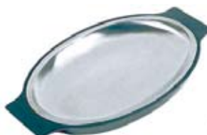
S/S SIZZLING PLATTERS 11-5/8"X8"