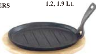
CAST IRON STEAK PLATTERS W/WOOD UNDERLINER