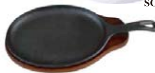
CAST IRON PLATTERS W/HANDLE