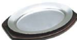
ALUMINUM SIZZLING PLATTER 10-1/2" x 7" 11-1/2" x 8", 12-1/2" x 8-1/2"