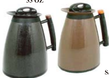
ELLI THERMAL SERVERS 20, 50, 66 OZ