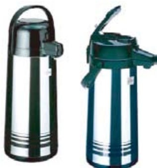
GLASS LINED SERVERS BRUSHED S/S BODY, LEVER TOP 1.9lt./ 64 OZ, 2.2 Lt./74 OZ, 2.5 Lt./84 OZ