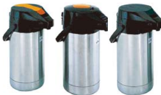
SATIN S/S BODY 2.5 Lt./84 OZ 3.0 Lt./101 OZ LEVER TOP/BUSH BUTTON