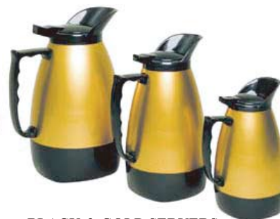
BLACK & GOLD SERVERS 20, 32, 64 OZ