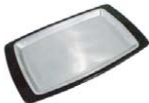
ALUM. SIZZLING PLATTER 10 1/2"X7", 11 1/2"X8", 12 1/2"X8 1/2"