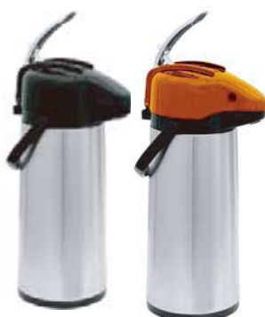
2.2 LITER VAL-U-AIR SERVERS S/S, GLASS LINED W/LEVER-TOP 2.2 Lt.