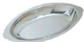
AU GRATIN DISHES 8, 12, 15, 20 OZ