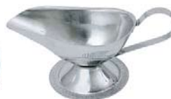
GRAVY BOATS 3, 5, 8 OZ