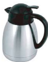
S/S BUSH-BUTTON TOP 1.2, 1.9 Lt.