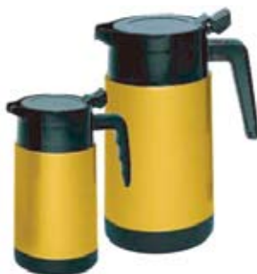
BLACK & GOLD SERVERS CYLINDRICAL 20, 40 OZ