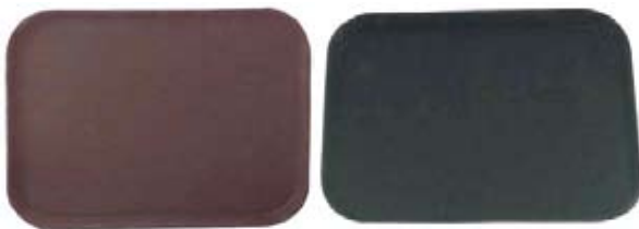
NON-SLIP GRIP TIGHT TRYS BROWN / BLACK RECTANGLE 14" x 18"