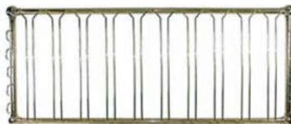
GLASS HANGER RACKS 36"X14" WITH 6 EXTENSIONS. 48"X19 1/2" WITH 6" EXTENSIONS