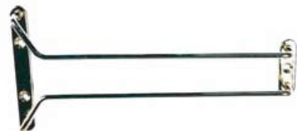
GLASS HANGERS 10", 16", 24"