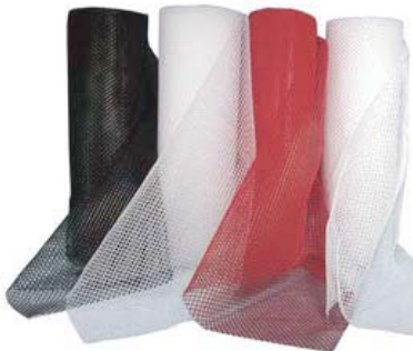
BAR SHELF LINERS 2'X40', BLACK, RED, CLEAR, WHITE