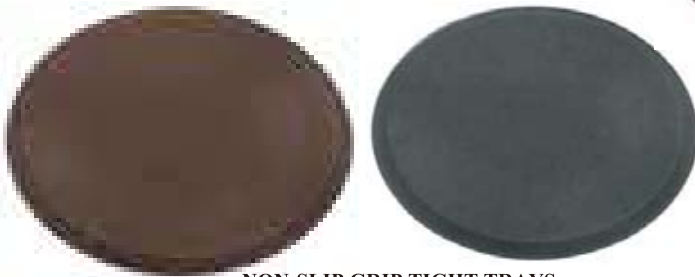
NON-SLIP GRIP TIGHT TRAYS BROWN / BLACK OVAL SHAPE 22"X27"