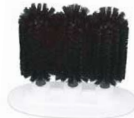
GLASS WASHING DEVICE 3 BRUSHES W/SUCTION GRIP BASE