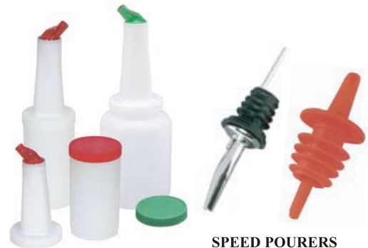
FLOW-N-STOW POUR BOTTLES 1Qt. 2 Qt.