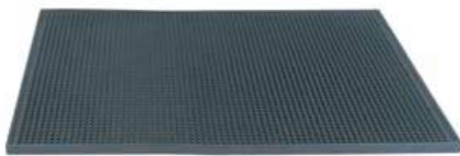
BAR SERVER MAT, BLACK, 17 3/4"X12"