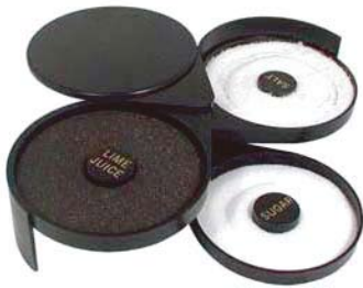
GLASS RIMMERS REPLACEMENT SPONGE 3 TRAYS, BLACK