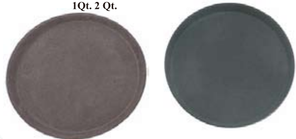
NON-SLIP GRIP TIGHT TRYS BROWN / BLACK ROUND SHAPE: 11", 14", 16"